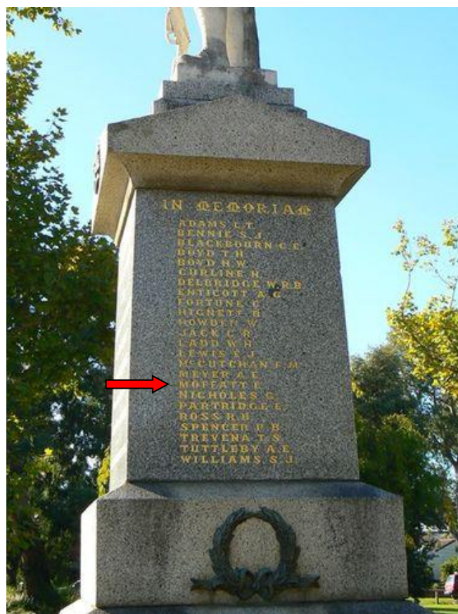
Alphington Soldiers' Memorial