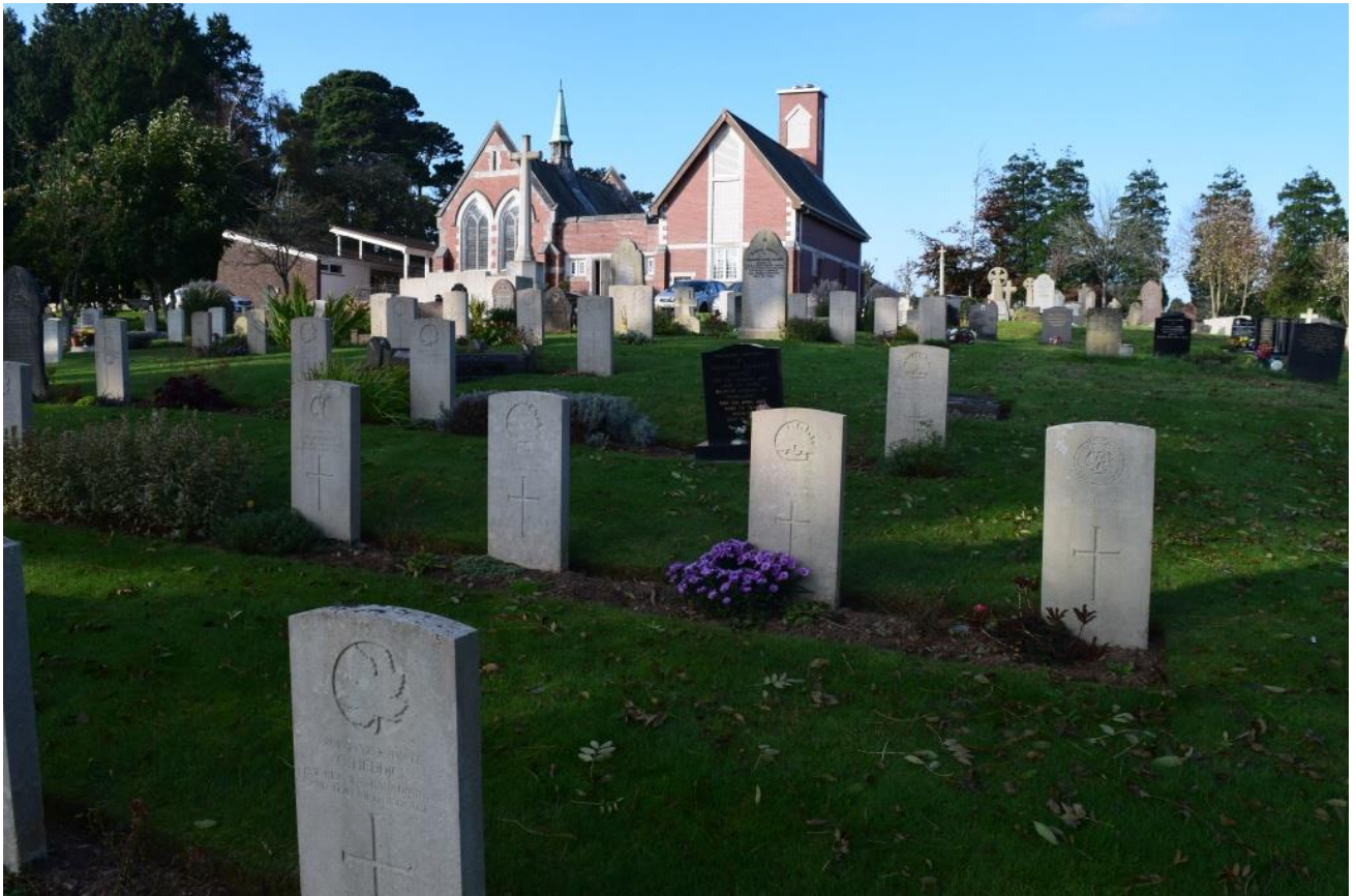
War Graves in Efford Cemetery, Plymouth