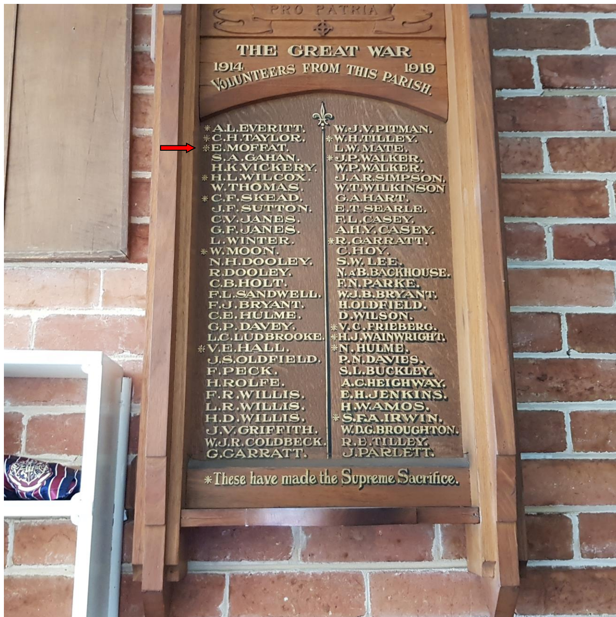
St. James Anglican Church Roll of Honour