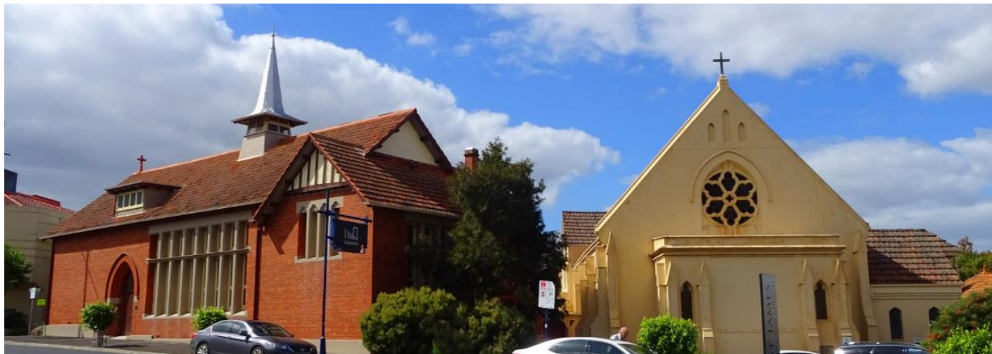
St. James Anglican Church, Ivanhoe