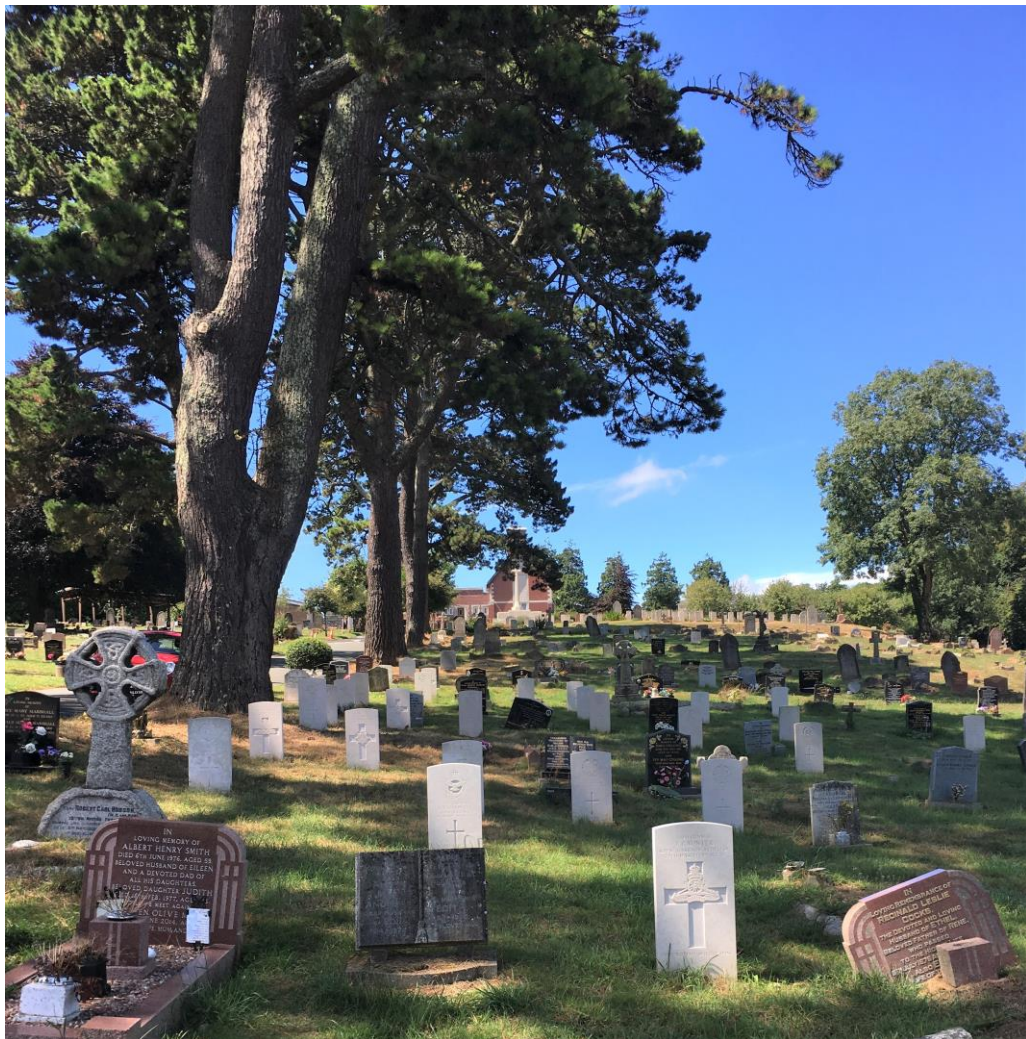
Scattered War Graves in Efford Cemetery, Plymouth